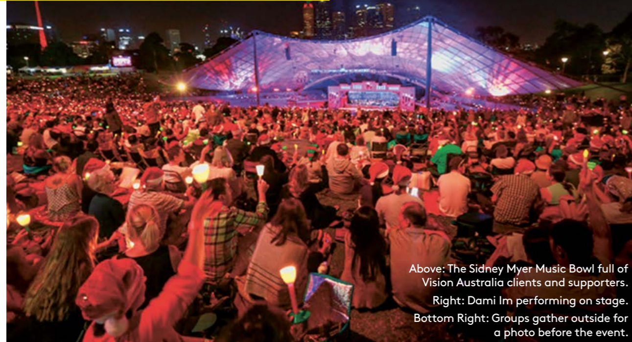
Above: The Sidney Myer Music Bowl full of Vision Australia clients and supporters.