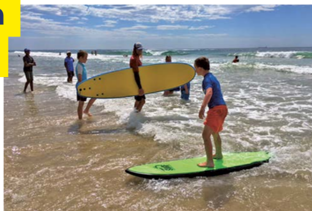
Children enjoying the surf